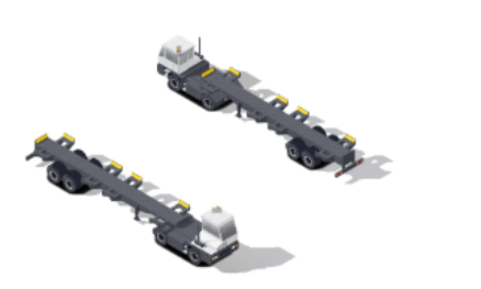
Maximise CHE Efficiency Reducing fuel usage, associated costs, contributing to the terminals environmental, social, and governance (ESG) goals

Complexica's port productivity solution - Yard Optimiser - is powered by our proprietary AI engine Larry, the Digital Analyst<sup>®</sup>. Using data augmentation and analysis, Larry can determine the most suitable yard placement for containers, taking into account Terminal Operating System (TOS) business rules with predictive vessel and trucking movements/bookings.